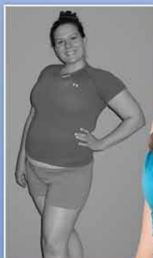
Results not typical.

"At 133 lbs, my heart rate is normal, I'm not out of breath, my knees went from crunching and buckling when I walked to being pain-free, and I can touch my toes during yoga!"